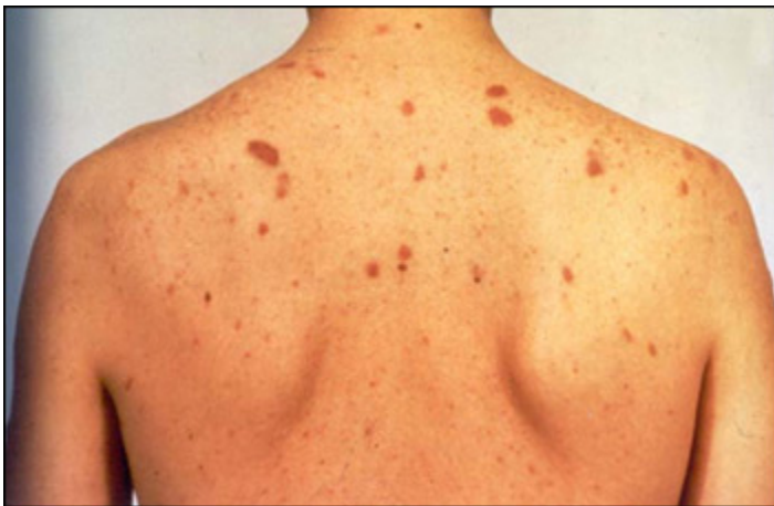
A person's back with purplish lesions of Kaposi's sarcoma. The purplish lesions of Kaposi's sarcoma, a cancer not usually seen in young men, were common among the patients with the new immune deficiency disease