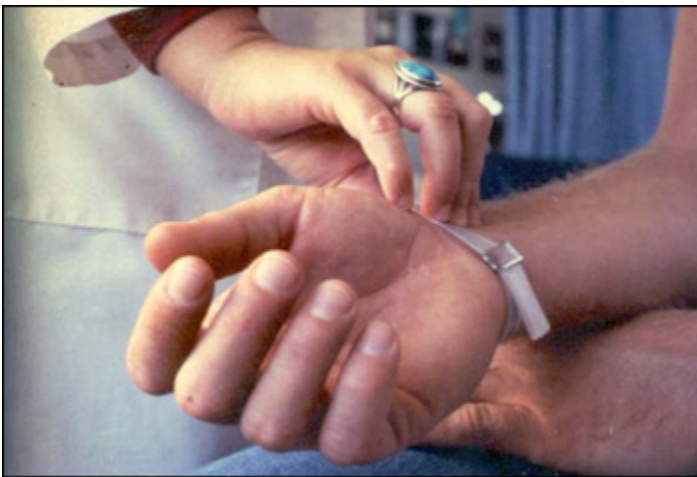
Healthcare worker takes a patient's pulse.