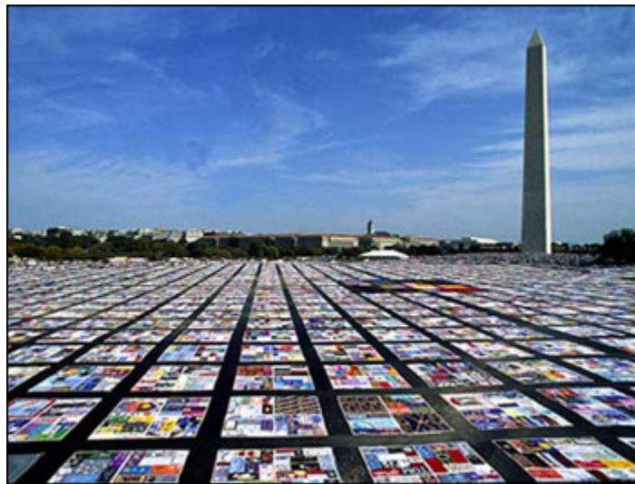
The NAMES Project AIDS quilt, representing people who have died of AIDS, in front of the Washington Monument