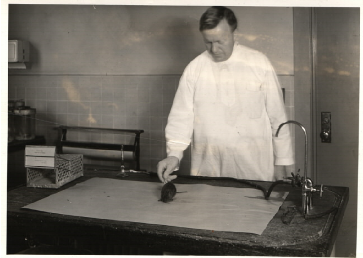
Dr. Charles Armstrong examining small rodents for signs of paralysis, in the old Hygienic Laboratory-NIH Building, probably around 1939.

half-grown female, No. 947, were trapped on January 25 in the kitchen. Pooled tissues from each of these mice produced transmissible infections in susceptible laboratory mice.