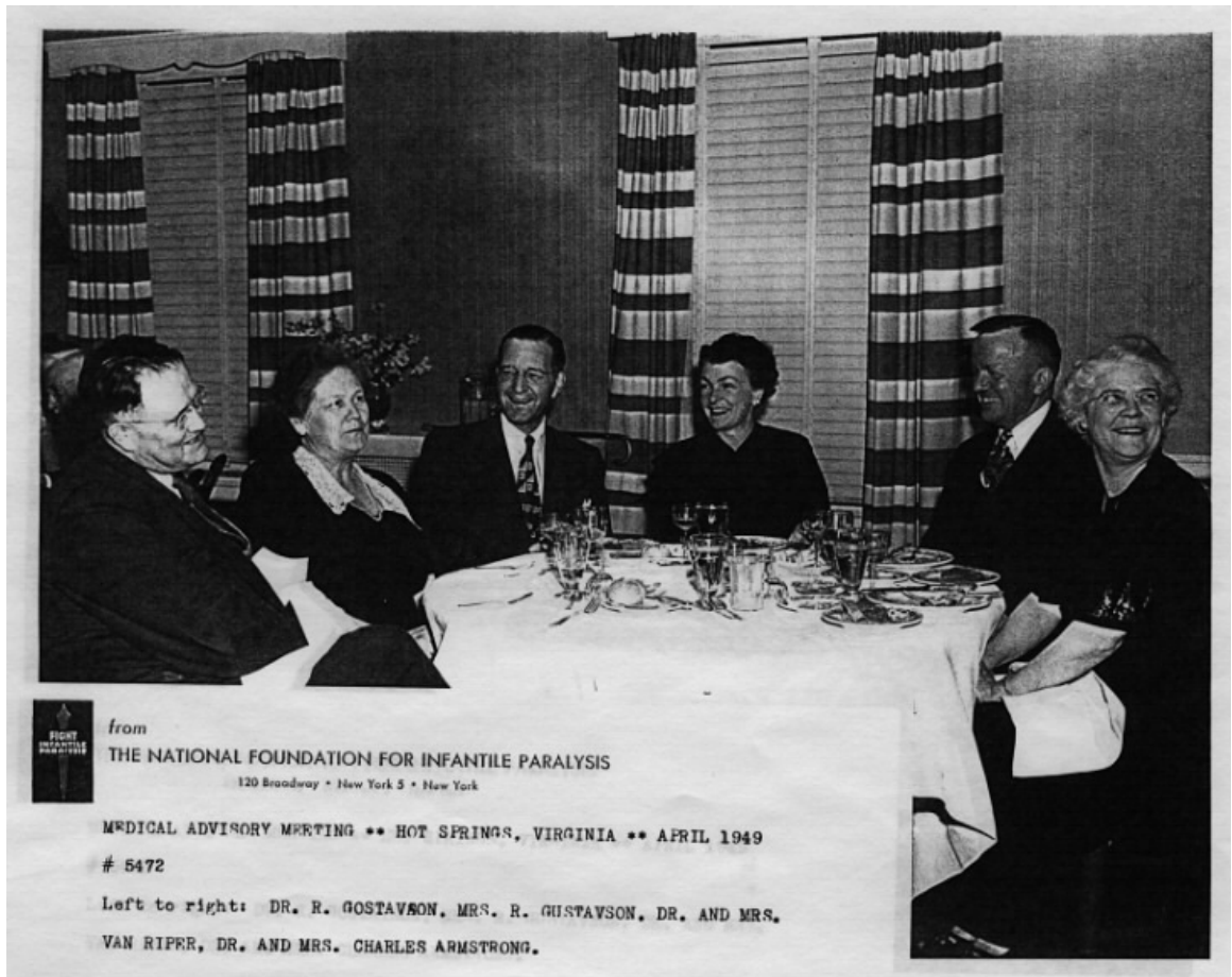
Medical Advisory Meeting, National Foundation for Infantile Paralysis, Hot Springs, Virginia, April 1949.