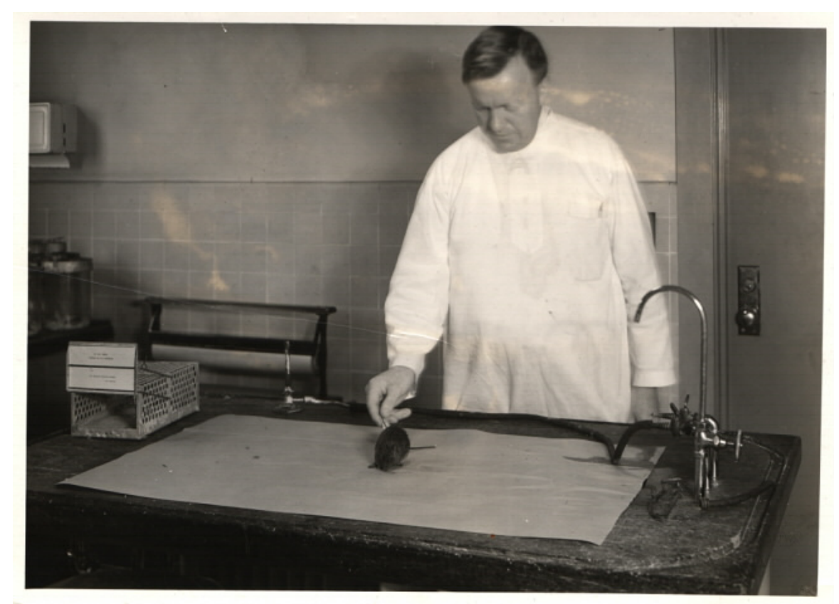
Dr. Charles Armstrong examining small rodents for signs of paralysis, in the old Hygienic Laboratory-NIH Building, probably around 1939.

half-grown female, No. 947, were trapped on January 25 in the kitchen. Pooled tissues from each of these mice produced transmissible infections in susceptible laboratory mice.